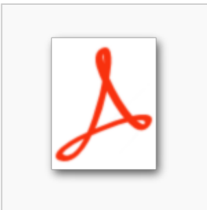
ASL two servers one ... 57 KB

The following 2 files are in this category, out of 2 total.